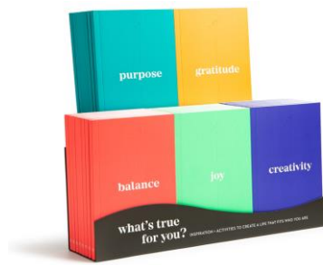
ITEM NO. 10468 | $200.00